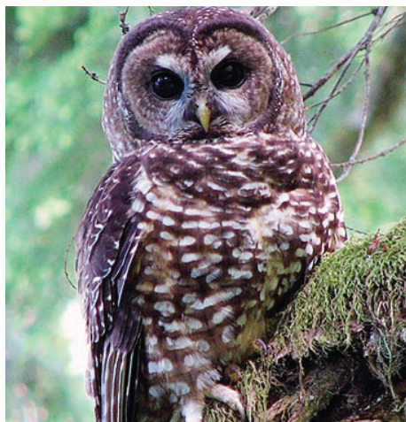
Figure 2: Northern Spotted Owl ( Strix occidentalis caurina )

Under the Endangered Species Act (ESA), for any project that has the potential to affect federally threatened or endangered species and/or their habitats, FEMA must consult with the U.S. Fish and Wildlife Service (USFWS) or National Marine Fisheries Service (NMFS). Typically, this process results in the development of measures to avoid or minimize impacts to such species and/or habitats.