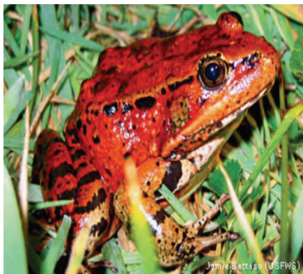
Figure 1: California Red-legged Frog ( Rana draytonii )

The Clean Water Act (CWA) apply to actions affecting “waters of the United States”. This includes any part of a surface water system: natural waters including oceans, seas, bays, lagoons, streams, lakes, and wetlands; as well as isolated human-made waters. The U.S. Army Corps of Engineers (USACE) regulates this law.