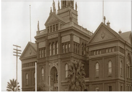
Figure 3: San Diego County Courthouse (1889)

All proposed projects that have the potential to affect historic properties must be reviewed by FEMA and the State Historic Preservation Officer (SHPO). A historic property is any precontact or historic district, building, site, structure, or