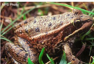
California red-legged frog

FEMA Biological Opinion https://fema.gov/disaster/4683/news-media