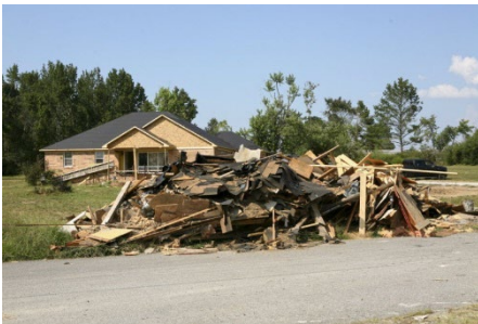
Figure 5. Image of debris staged on the side of the road.

Management of storm-related debris (e.g., removal, staging, storage, sorting, and