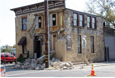
Figure 4. Image of damaged two story building.

All proposed projects which may affect historic properties must be reviewed by FEMA and the State Historic Preservation