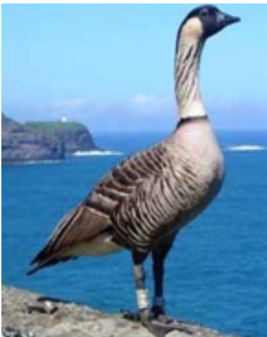
Figure 3. Image of goose on a rock.

Under the Endangered Species Act (ESA), for any project that has the potential to affect Federally threatened or endangered species or their habitats, FEMA must consult with the U.S. Fish and Wildlife Service (USFWS) or National Marine Fisheries Service (NMFS). Typically, this process results in the development of measures to avoid or minimize impacts to such species or habitats.