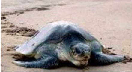
Figure 2. Image of sea turtle on beach sand.

The Clean Water Act (CWA) applies to actions affecting "waters of the United