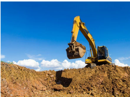
Figure 6. Image of bulldozer removing soil from a pit.

Any project involving ground disturbance outside the previously disturbed footprint, even if within an existing right-of-way (e.g., facility relocation, material borrowing, utility pole or fence replacement, and access road construction), may require archaeological and