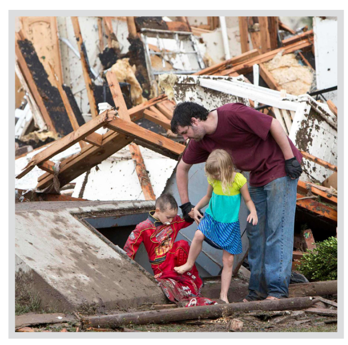
A family leaves their underground shelter after the 2013 Moore tornado (Reuters). <a href="https://www.nytimescom/2013/05/22/us/shelter-require-ments-resisted-in-tornado-alley.html?searchResultPosition=1">https://www.nytimescom/2013/05/22/us/shelter-require-ments-resisted-in-tornado-alley.html?searchResultPosition=1</a> (accessed March 12, 2020)

weather service. Immediately, the weather service issued a tornado warning for the city of Moore. With this warning, the people in the town began to gather their families and seek safety. The tornado started west of the city of Moore, traveled east to cross the Canadian River, and then began to strike the more heavily populated city. In town, the tornado traveled through Briarwood Elementary and Plaza Towers Elementary Schools, right at the end of the school day. At Briarwood, the students found shelter in classrooms, hallways, and bathrooms, and they used books to protect their heads. Partway through the tornado strike, another teacher moved students into the bathrooms, which saved their lives, as the walls fell over at the same