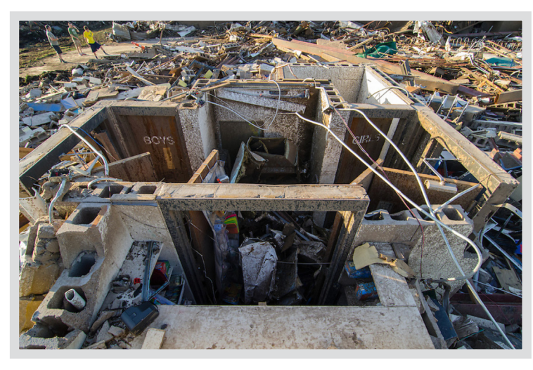
Briarwood Elementary student bathrooms remain standing after an EF-5 tornado struck Moore, Oklahoma on May 20, 2013.

Even though some homes and businesses had storm shelters, there wasn't enough space for everyone. Over 12,000 homes