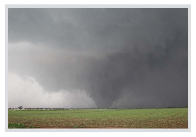
Category 5 tornado of 2013 (Gabe Gafield). <a href="https://www.weather.gov/oun/events-20130520-ef5torna-do">https://www.weather.gov/oun/events-20130520-ef5torna-do</a> (accessed March 12, 2020)