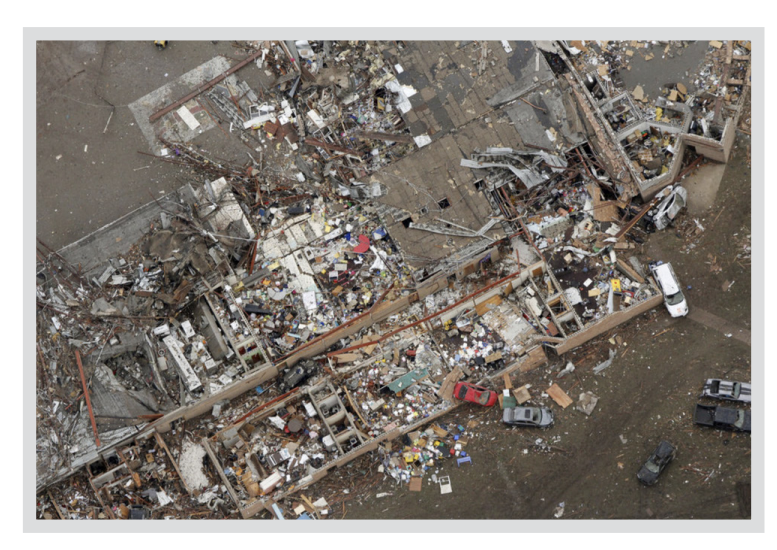
Aerial photo of Plaza Towers Elementary School destruction after the 2013 tornado

were damaged or destroyed during the tornado. Newer schools were equipped with storm shelters for the students; however, older school buildings like Briarwood, Plaza Towers, and Highland East didn't have storm shelters available to students and teachers. Rescue workers and neighbors joined together to search the rubble for anyone missing. In the end, there were 24 fatalities; 10 were children, including 7 students who died at Plaza Towers Elementary School. About 320 community members were injured. It was a devastating event for the citizens who call Moore their home.