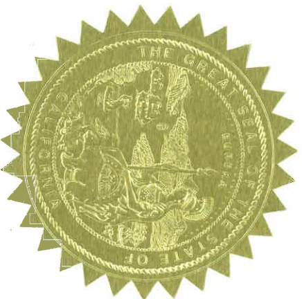
GAVIN NEWSOM Governor of California

IN WITNESS WHEREOF I have hereunto set my hand and caused the Great Seal of the State of California to be affixed this 12th day of January 2025.