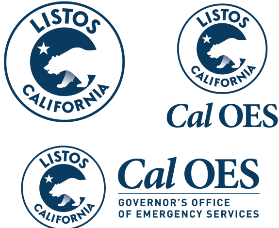
One Color Version