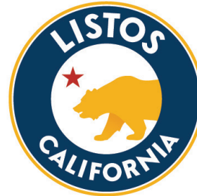
English & Spanish

The Listos California logo works as-is in both English and Spanish. It also is available in other languages: Chinese (Traditional), Filipino, Vietnamese, Korean, Hmong, and Punjabi. Additional languages may be made available upon request.