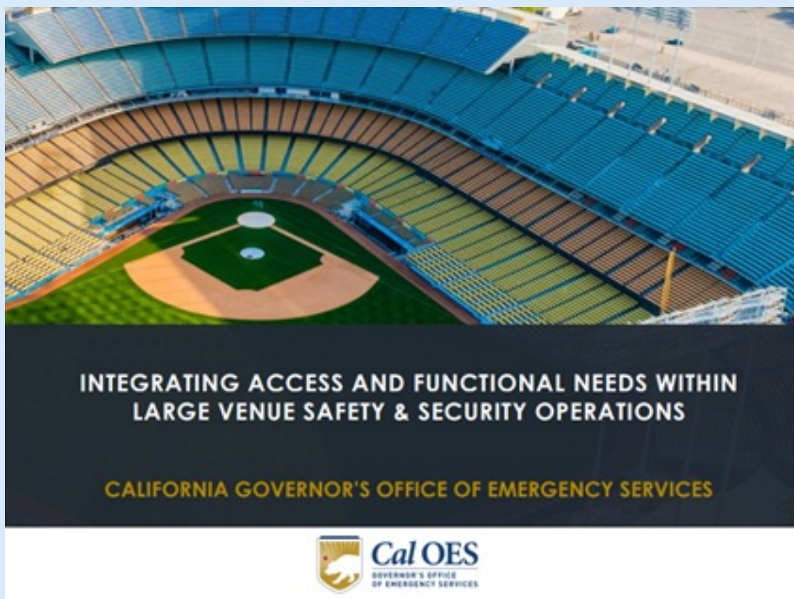
Large Venue Guide document cover

Cal OES has released a new guide to support large venues (e.g., stadiums, arenas, amphitheaters, motorsport sites, etc.) as they strive to meet the safety and security considerations of all guests.