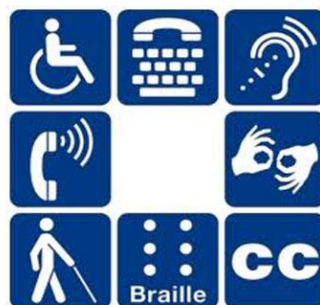
Effective Communication Symbols

Cal OES and FEMA are committed to helping survivors with disabilities and access or functional needs who may need additional assistance during the recovery process. This may include help