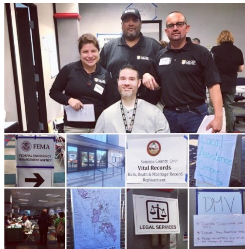
October 2017 Wildfire Response Activities

The October wildfires illustrate that, for the communities we serve, the integration of access and functional needs is often the difference between life and death. Of the 43 individuals who perished, a great many had access and functional needs. This is the reality of what we experienced. And while we cannot change what happened, we can – and should – use the memory of this tragedy to recommit ourselves to integrating access and functional needs in a more meaningful way and to a more impacting degree.