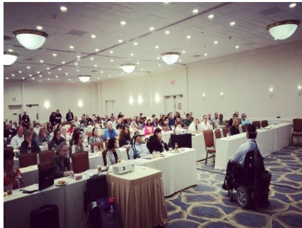
Getting it Right Irvine