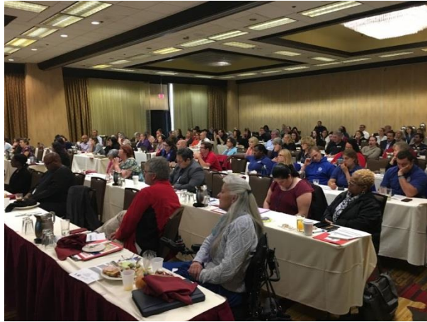
Getting it Right Sacramento

Copies of the combined agenda for each event as well as the presentation slides can be accessed via the AFN Library section of the OAFN website.