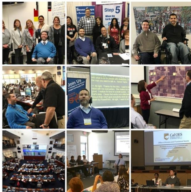
Photo Collage of Meetings with Partners

We invite you to read and enjoy as our partners describe the work they do and how we collaborate and support one another to ensure the needs of California's whole community are addressed, integrated and met!