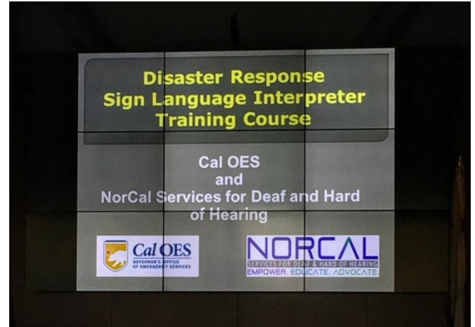
DRI Training Course Slide