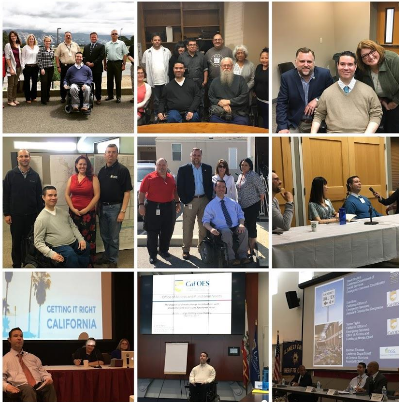
Photo Collage of Presentations

Since the beginning of the year, California has had four presidentially designated disasters and nearly each of the state's 58 counties have declared emergencies. Yes, 2017 has been a wild ride! Given the scope and scale of what Californians have endured, not to mention the stress placed upon our emergency management system, it has been a marvel to witness, first-hand, just how resilient the Golden State is becoming.