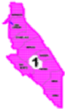
Phase 1: Completed